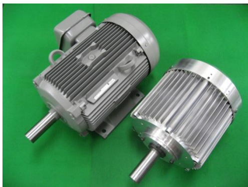
Fig. 3. Comparison of motor size

Left: Conventional industrial 11kW induction motor Right: New motor developed