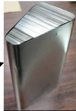
Fig. 2. Stratified amorphous metal core