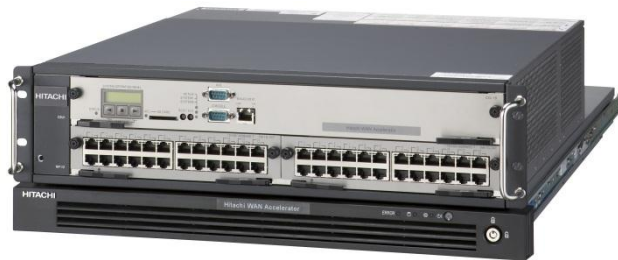
Hitachi WAN Accelerator Remote Backup Model

- Approximately 26 Times Faster Remote Backup of Large-Volume Data Between Data Centers -