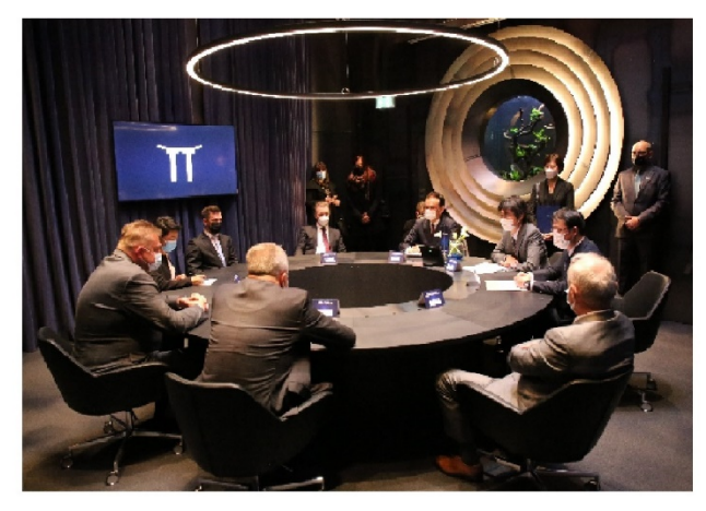
The online ceremony to celebrate the start of operation