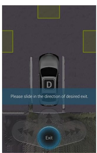
Vehicle position selection screen when exiting a parking space