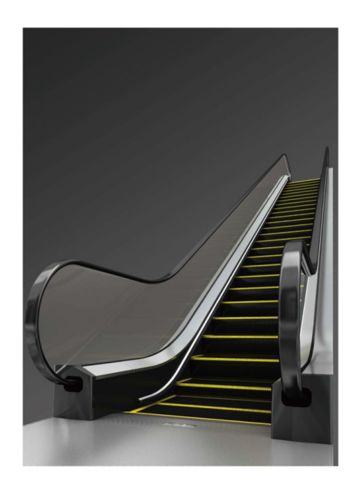
External appearance of the new TX Series escalator

Tokyo, August 21, 2017 --- Hitachi, Ltd. (TSE: 6501, "Hitachi") and Hitachi Building Systems Co., Ltd. today announced the launch of the new TX Series escalator for India, Asia and the Middle East. The escalator has already been released in China*1, and will be released in stages across the remainder regions, commencing August 21, 2017.