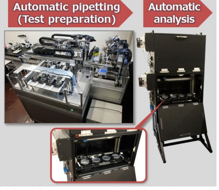
HirotsuBio's "N-NOSE" cancer screening method