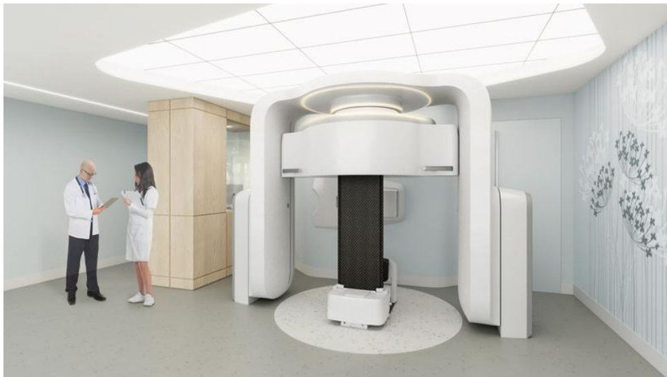
Image of treatment room with Leo’s upright patient positioning system

UW Health broke ground on Eastpark Medical Center in May and it is expected to open in 2024.