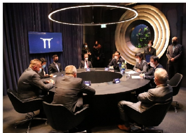
The online ceremony to celebrate the start of operation