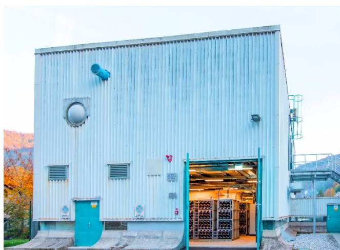
The storage batteries which were installed in the power distribution grid in the Idrija district

Based on the analysis and evaluation results of the demonstration project, we will consider the development of the business model in the form of a service, primarily in Europe, that provides cloud-based AEMS along with cloud-based DMS (completed in 2019). Along with the start of this demonstration operation, an online ceremony to celebrate the start of operation was held connecting Slovenia with Tokyo, which involved parties attended from both countries.