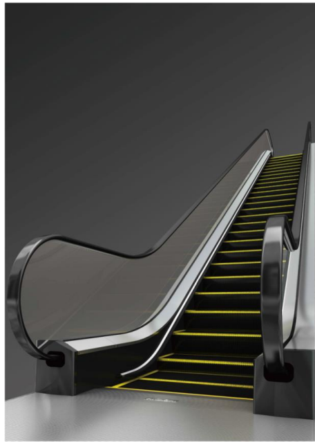
External appearance of the new TX Series escalator

Tokyo, August 21, 2017 --- Hitachi, Ltd. (TSE: 6501, “Hitachi”) and Hitachi Building Systems Co., Ltd. today announced the launch of the new TX Series escalator for India, Asia and the Middle East. The escalator has already been released in China* 1 , and will be released in stages across the remainder regions, commencing August 21, 2017.